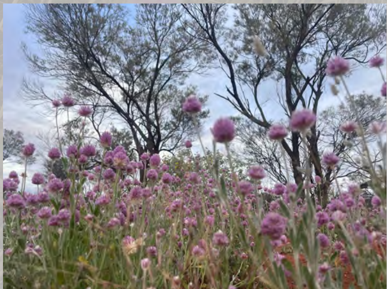
Above between Niagara and Kookynie

If you spot any, why not grab your camera and send us a pic, we'd love to share and full credit will be given