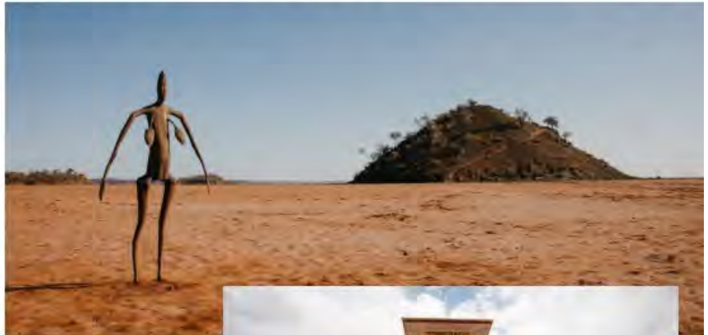
Antony Gormley's sculptures at Lake Ballard are a drawcard for visitors (above).

Before the sculptures though, it was gold which put Menzies on the map. The precious metal was first discovered in