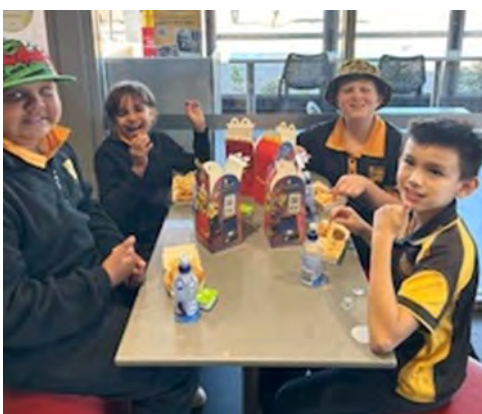
Enjoying lunch with friends