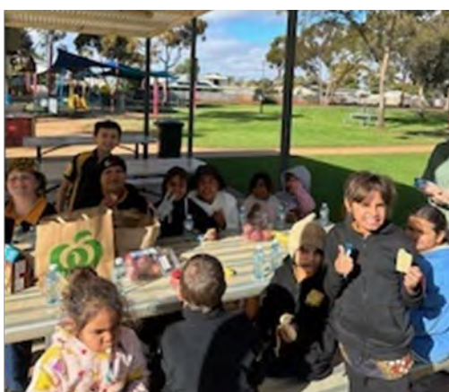
Recess at Hammond Park

And what a reward it was! Students who attended school 80% or more were treated to an attendance reward each term. This term's reward was a $20 shopping spree in Kalgoorlie and lunch at McDonalds.