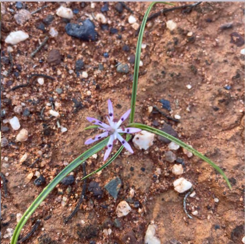
Above spotted around Menzies