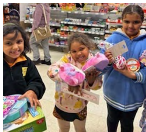
Proudly showing off some of their purchases