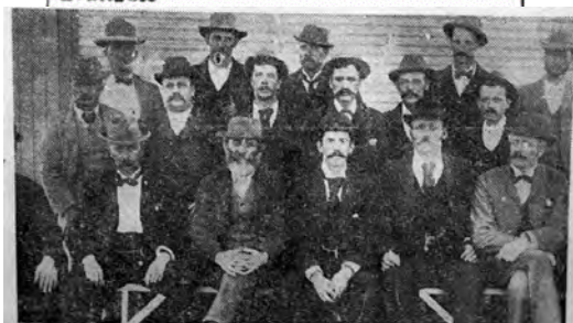
Some pioneers of Menzies, W.A., taken in 1894.