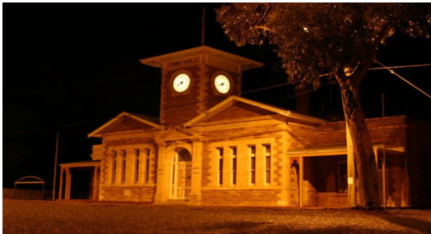
Menzies Shire Offices